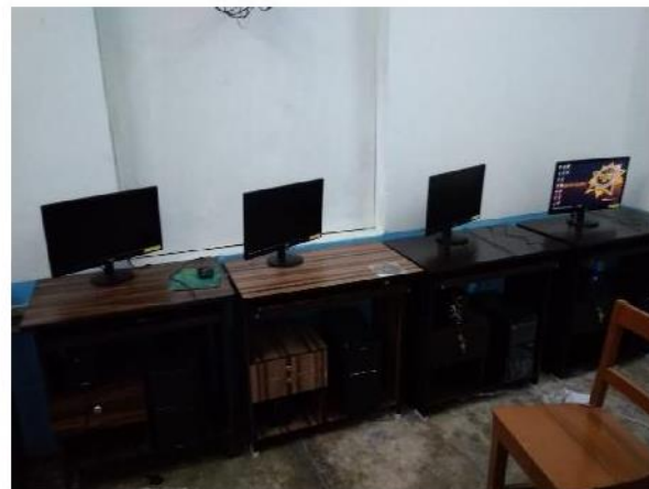
Desktops ready at Computr Lab, Rahara, RKM