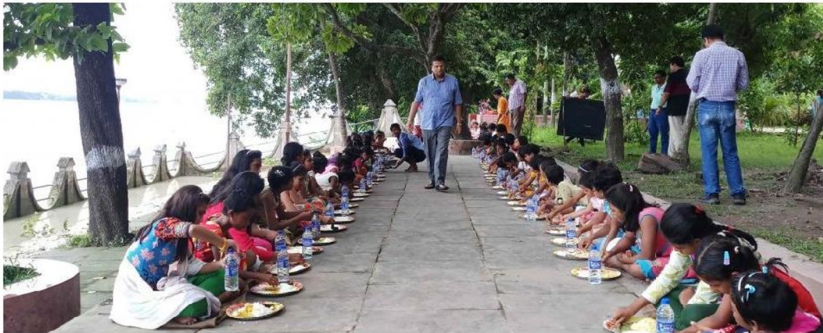
Community Lunch at Gobinda Home