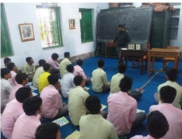
Spoken English Class at Rahara, RKM