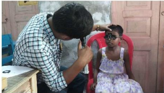
Eye Testing Camp at Gobinda Home